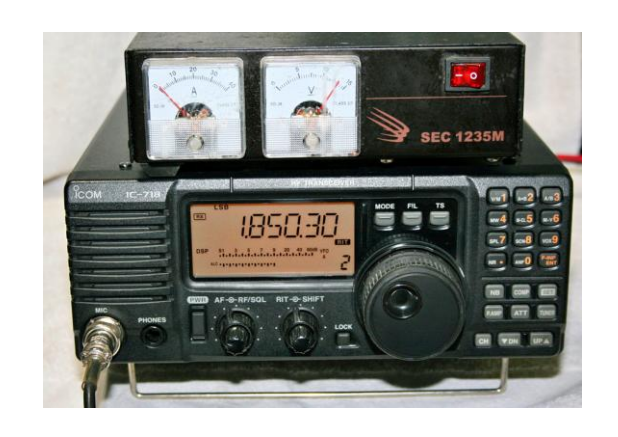
Continued pg. 5

$600 PayPal Goods & Services or cash only, local pick-up in Austintown, OH. KE8QOY